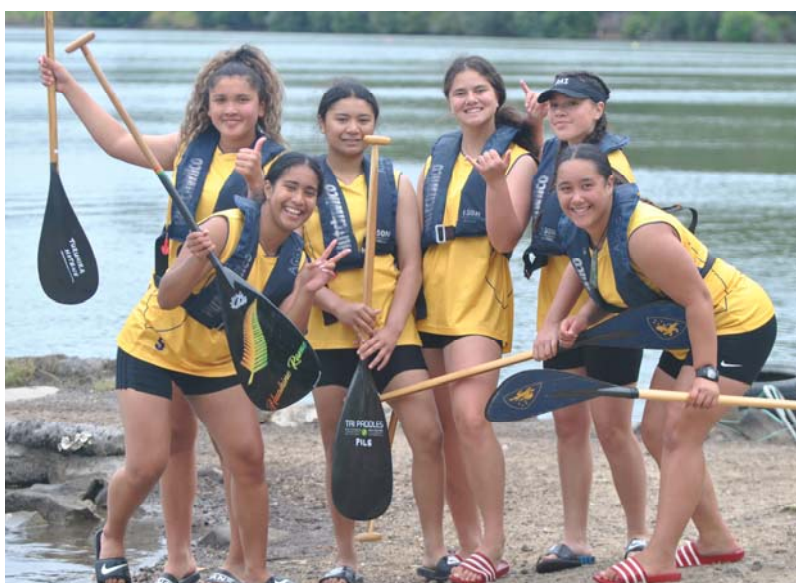
A very successful day on the water