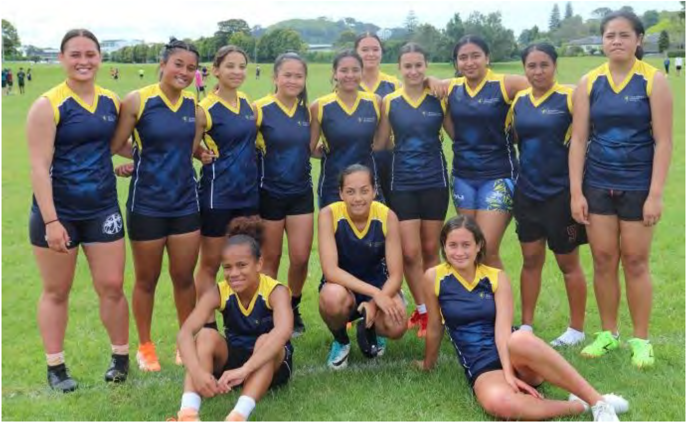
Junior Touch Team winners of the Central Zone Competition against Mt Albert Grammar School—winning score 9 to 1! The girls will be competing in the Auckland Championship on Tuesday 26 November. (above)