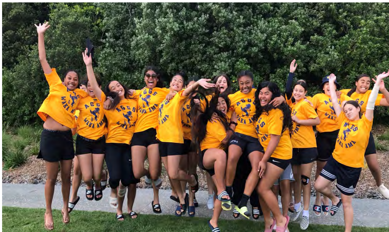
The Junior Waka Ama team jumping for joy after a very successful day's paddling!